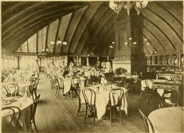
DINING ROOM--HYGEIA HOTEL.